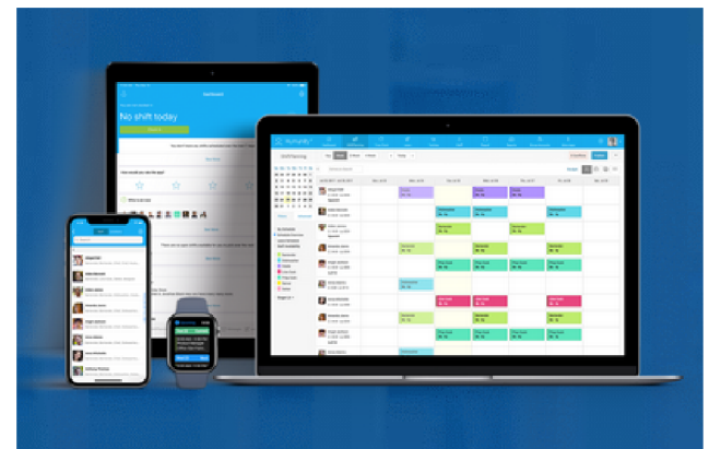
TCP Software Empowering people to work better.